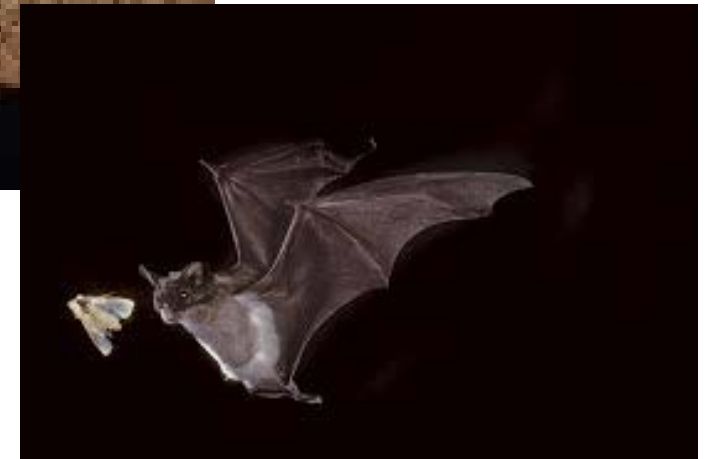
Mexican Free-Tailed Bat.