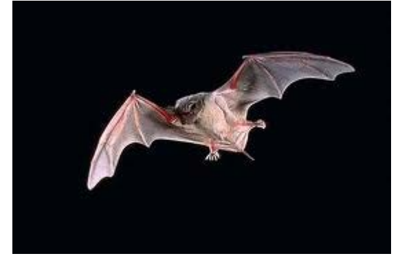
Little Brown Bat.