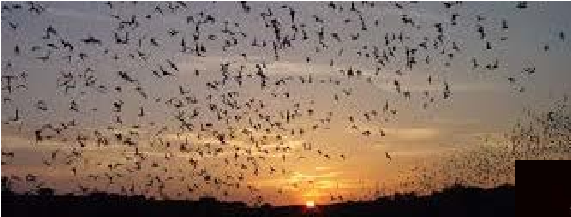
Bats in flight.